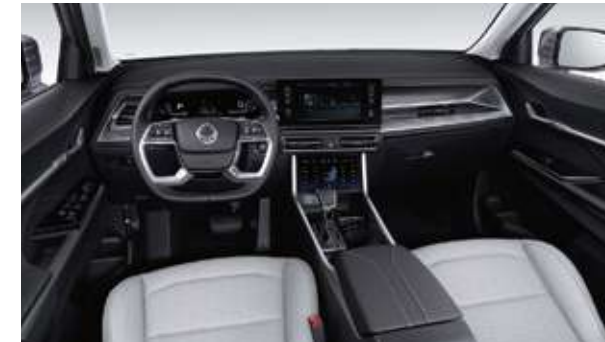
Light Grey Interior (ACE)