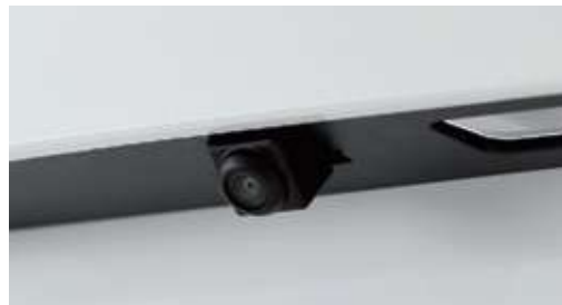
HD rearview camera