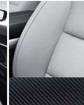
Leather (Thermoplastic polyurethane) Gun metal grain