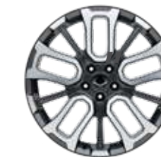
20 diamond-cut finished alloy wheels