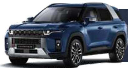
DANDY BLUE (BAS)