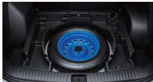
'Get you home' spare tyre

MAKE YOUR DRIVING SMARTER, EASIER AND MORE COMFORTABLE.