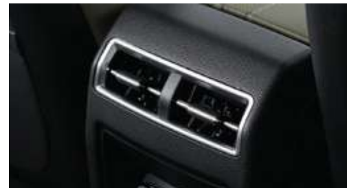
Rear centre console air vent