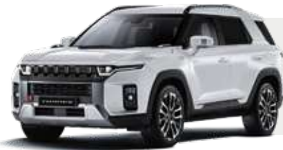
GRAND WHITE (WAA)