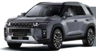
PLATINUM GREY (ADA)