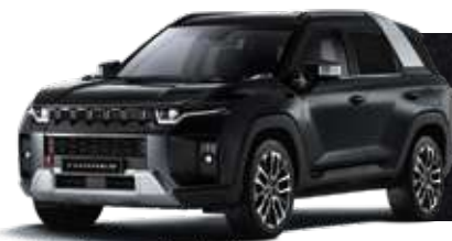
SPACE BLACK (LAK)