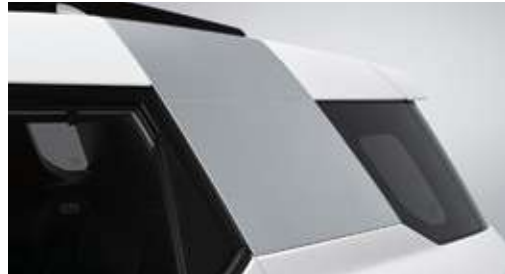
Metallic-look C-Pillar detail