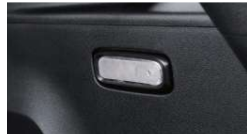
Load area light