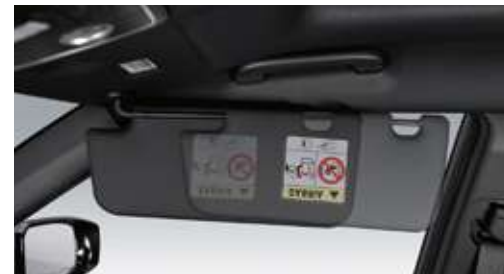
Sun visor with illumination and extension