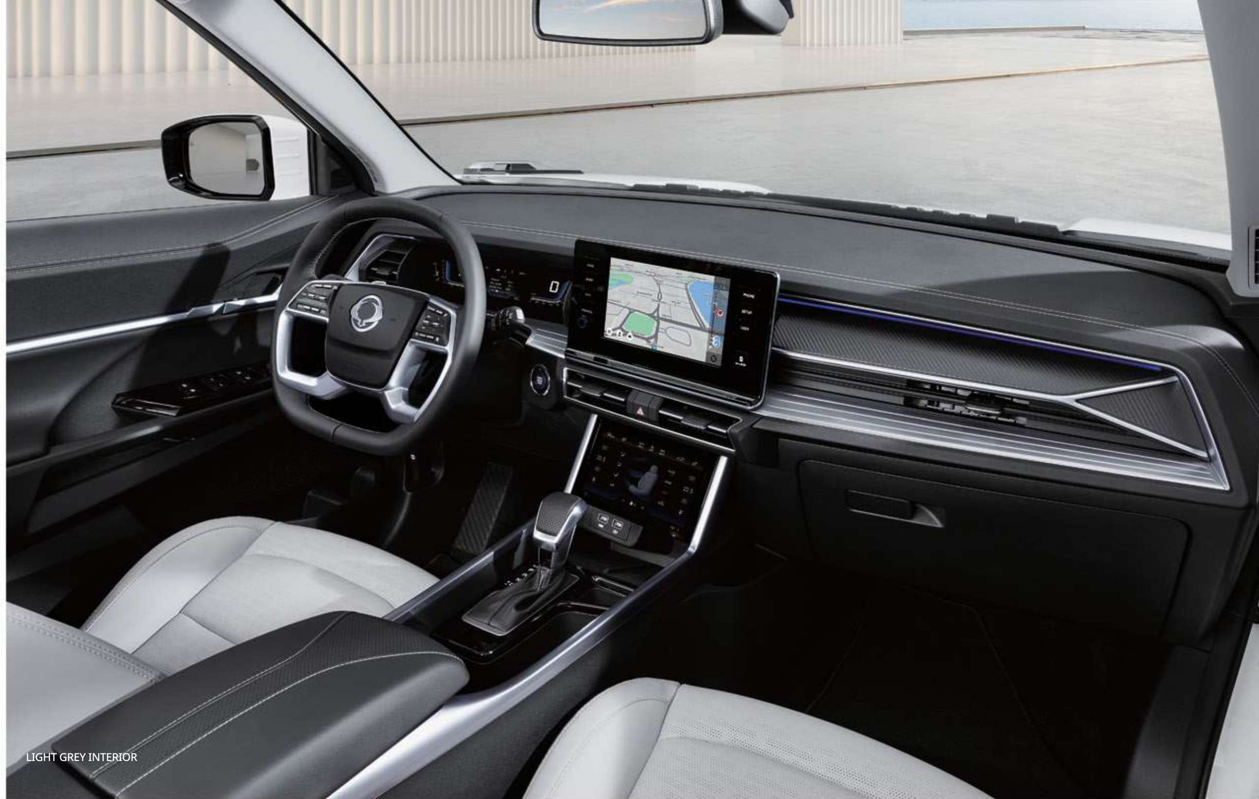
LIGHT GREY INTERIOR