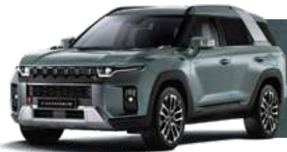
FOREST GREEN (GAO)