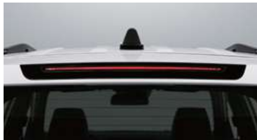
High mounted central LED stop light