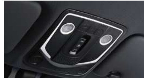
Overhead console with map light and sunroof control switch

MAKE YOUR DRIVING SMARTER, EASIER AND MORE COMFORTABLE.