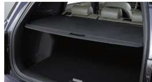
Load area cover