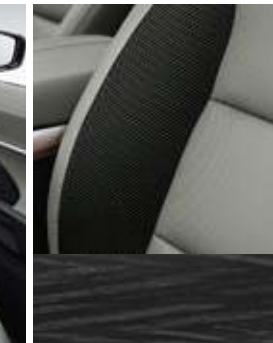
Leather and cloth combination seat Comb texture grain