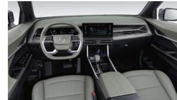
Khaki Interior (GAN)