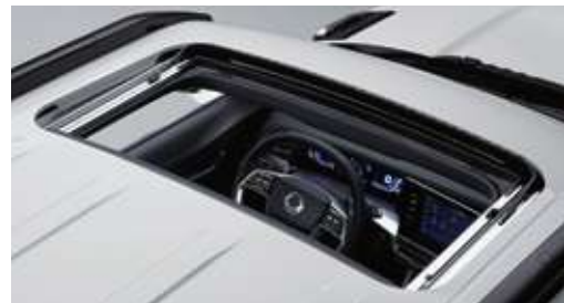
Powered safety sunroof