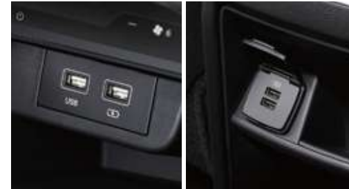
USB charger and USB slot, front and rear