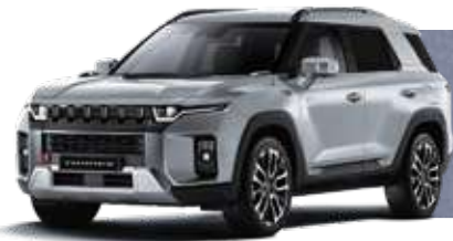
IRON METAL (ADE)