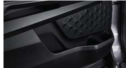
Door map pockets