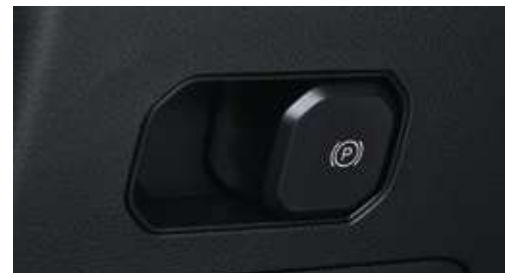
Electronic parking brake with auto-hold function