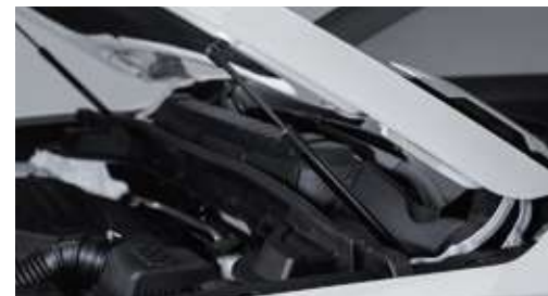
Gas strut bonnet supports