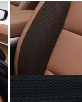
Leather and cloth combination seat Wave black high gloss grain