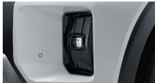
LED front fog lights