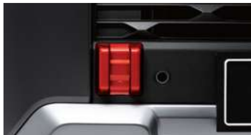
Trailer tow hitch mounting cover