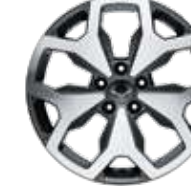
18" diamond-cut finished alloy wheels