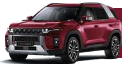
CHERRY RED (RAV)