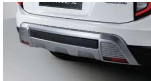
Metallic-look rear skid plate