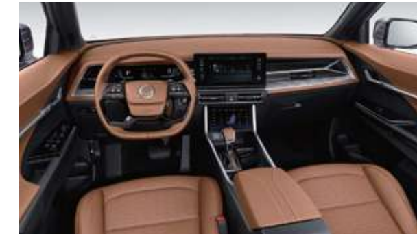
Brown Interior (OBB)