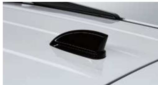
Shark-fin antenna with GPS