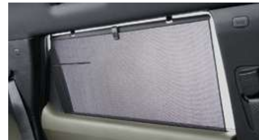
Manual roller blinds