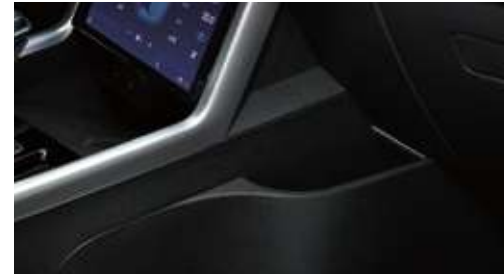
Front side storage box