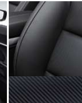
TPU (Thermoplastic polyurethane) Gun metal grain