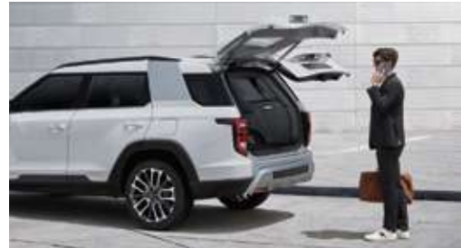
Electrically operated tailgate