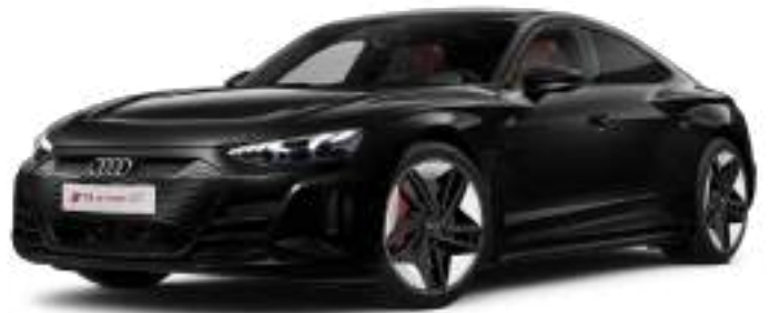
Myth Black Metallic