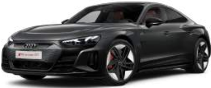
Daytona Gray Pearlescent