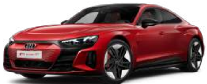
Tango Red Metallic