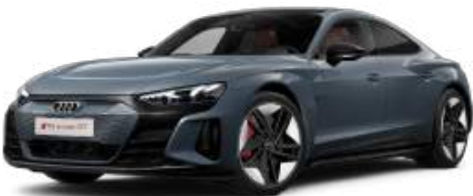
Kemora Gray Metallic