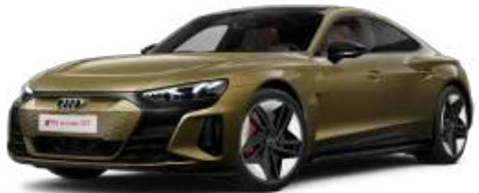
Tactics Green Metallic