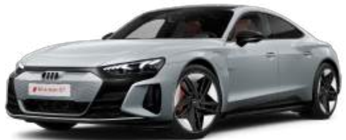
Suzuka Gray Metallic