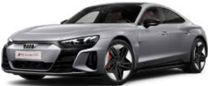
Floret Silver Metallic