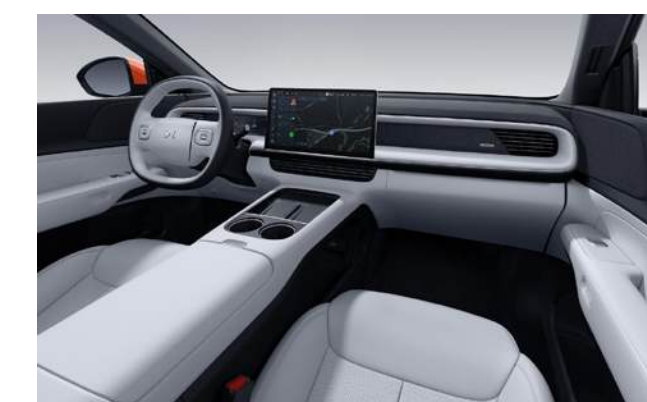
Vector star ring interior design