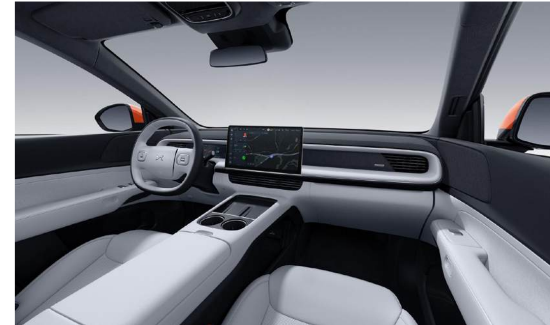
GRAY + BLACK HEADLINER