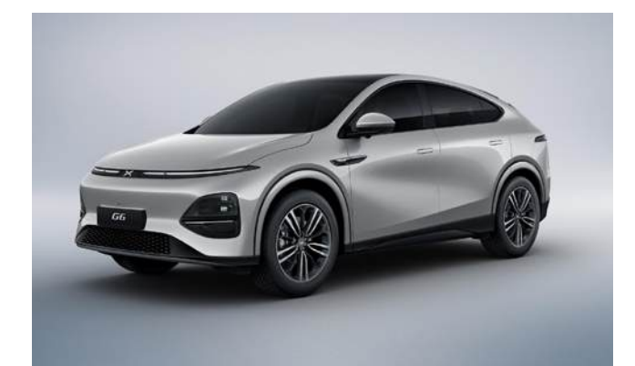
Ultra-low wind resistance pulse curvature