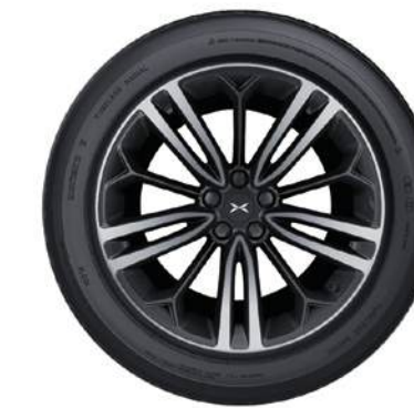
20-inch sport wheel hubs