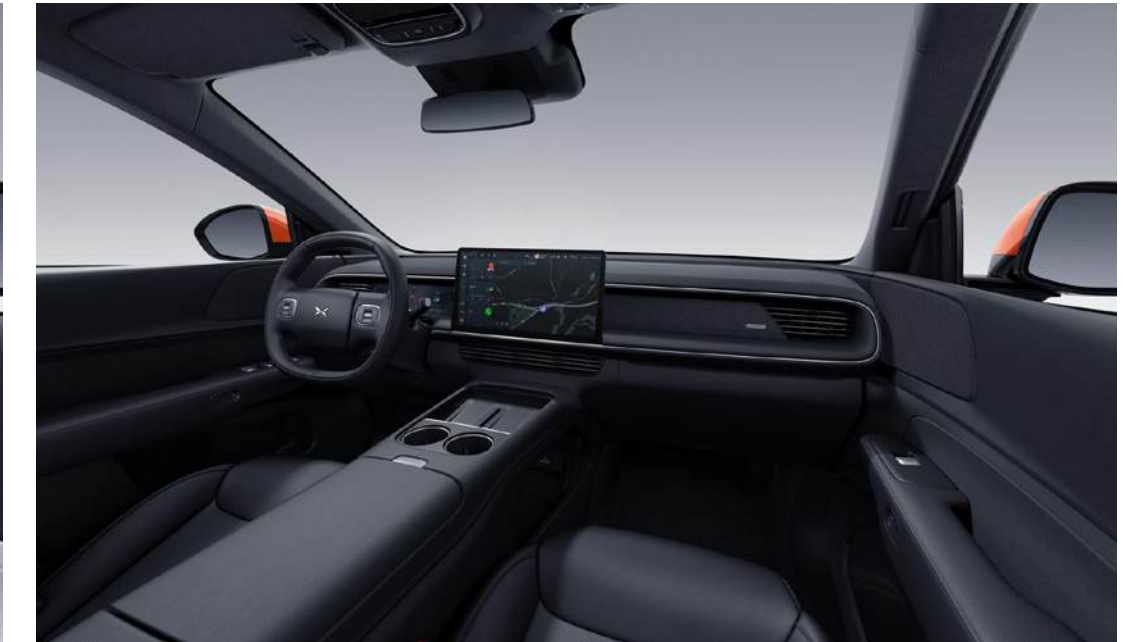
BLACK + BLACK HEADLINER