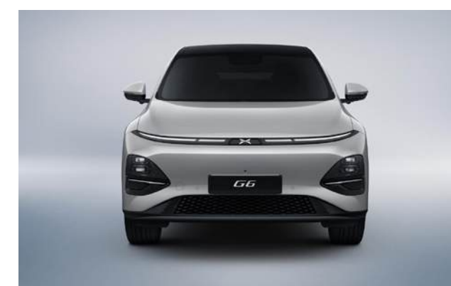
Robot Face Family Design

Release the imagination of the future and open a new era of intelligent driving.