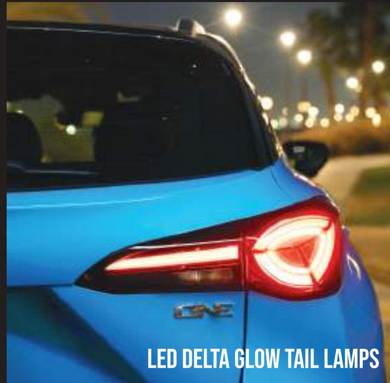
LED DELTA GLOW TAIL LAMPS