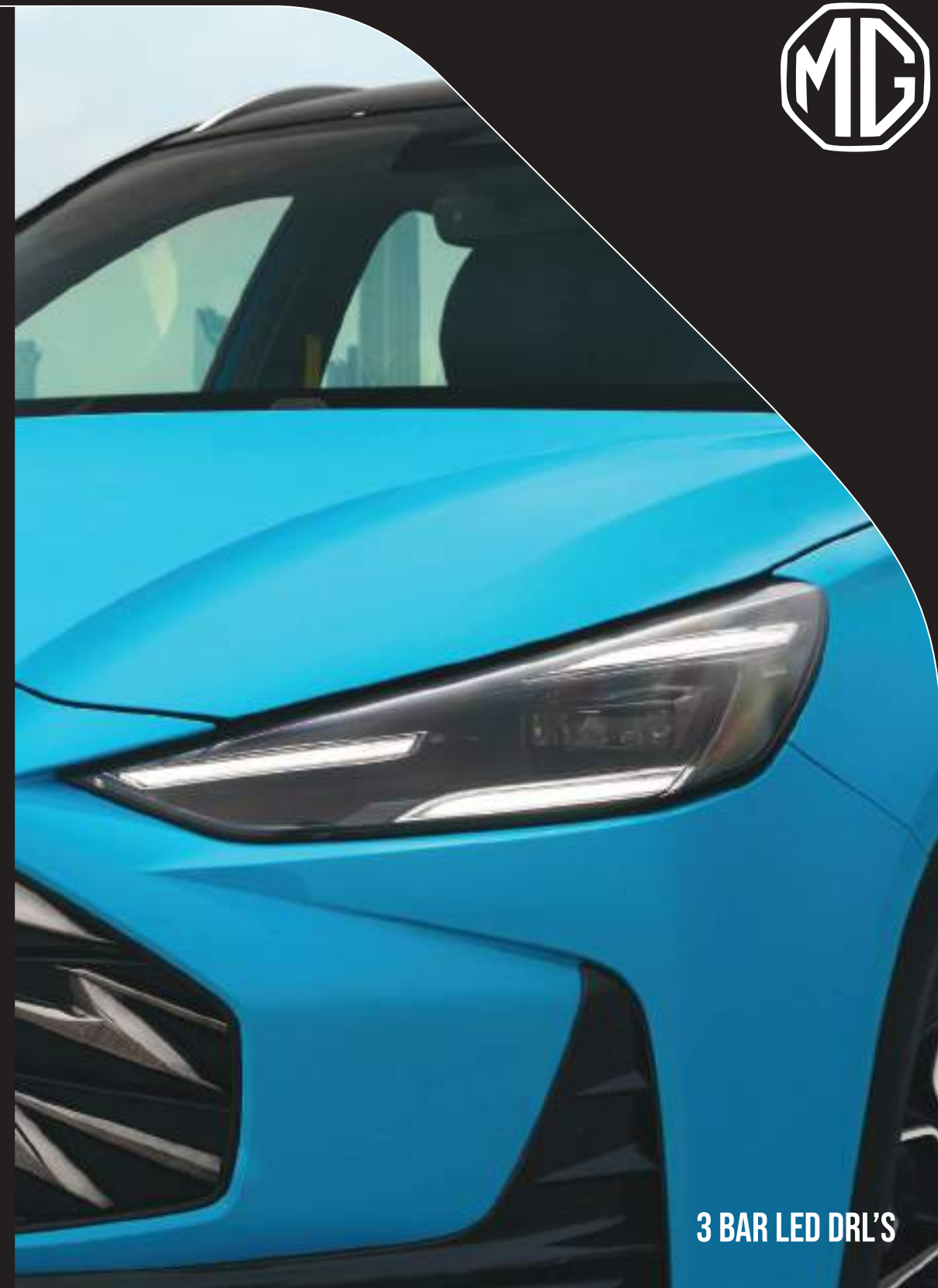
3 BAR LED DRL'S