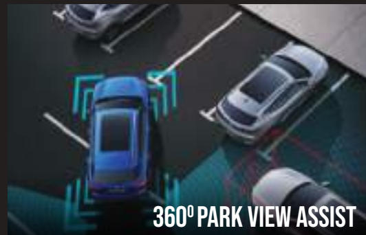
360° PARK VIEW ASSIST