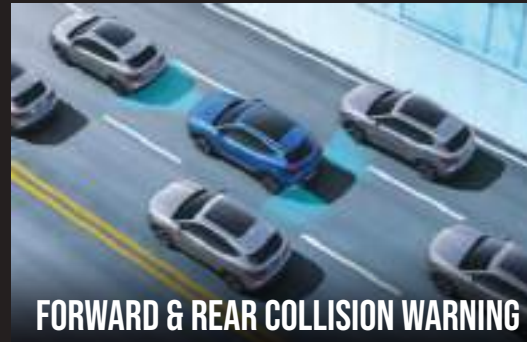
FORWARD & REAR COLLISION WARNING