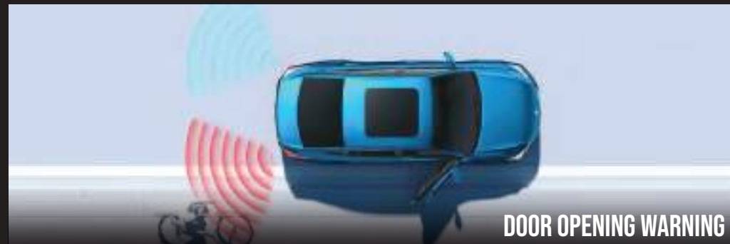
DOOR OPENING WARNING