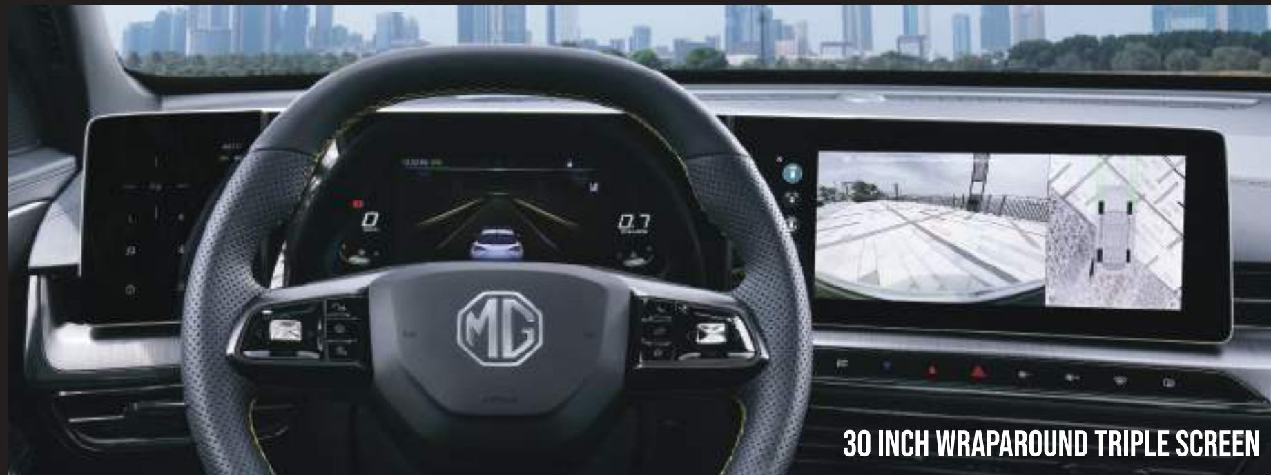
30 INCH WRAPAROUND TRIPLE SCREEN