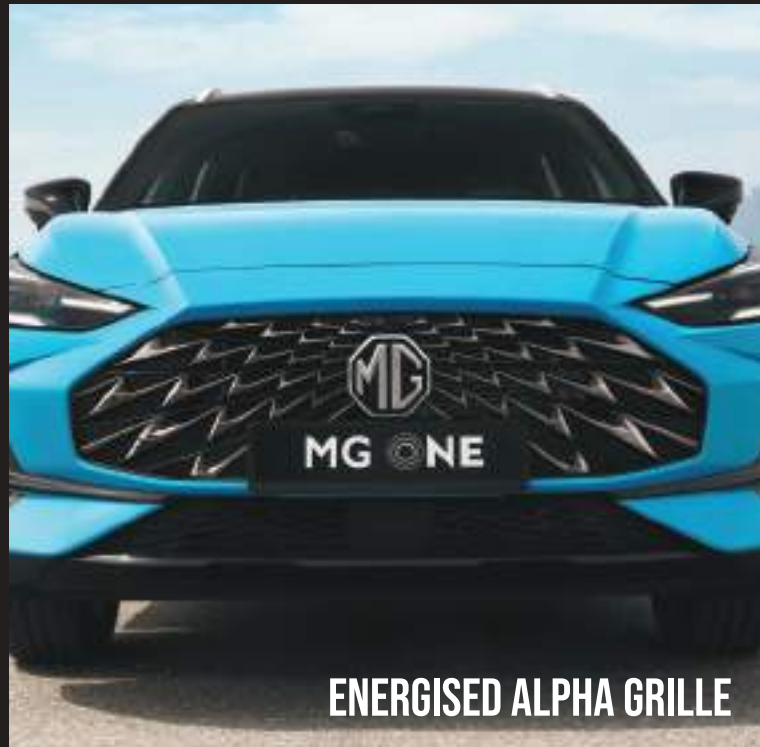
ENERGISED ALPHA GRILLE