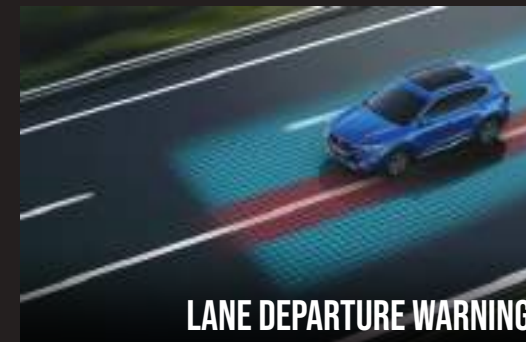
LANE DEPARTURE WARNING