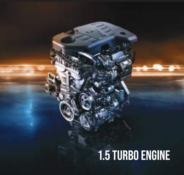
1.5 TURBO ENGINE

The MG ONE is powered by a turbocharged 1.5-liter engine mated with CVT Transmission, which delivers up to 181 horsepower or 285 NM of torque to cruise smoothly 0-100 kmph in 8.8 secs. Based on the Multiple Link Rear Suspension, the MG ONE brings a more stable and flexible driving experience. The handling experience is light at low speed and stable at high speeds. It's designed to cater to an active urban lifestyle. It is the first model based on SAIC Motor Intelligent Global Architecture (SIGMA), which allows for a flexible combination of over 100 kinds of modules.