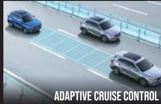
ADAPTIVE CRUISE CONTROL