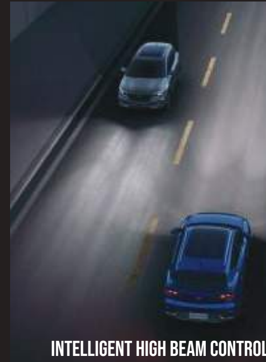
INTELLIGENT HIGH BEAM CONTROL