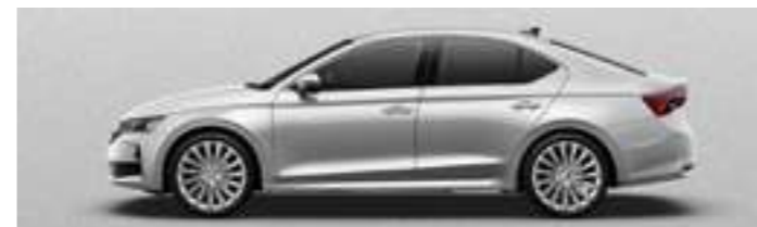
Brilliant silver metallic