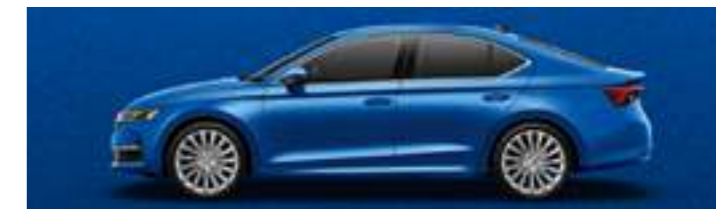
Race blue metallic (*)