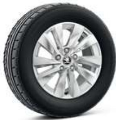
16" Matar Aero silver alloy wheels