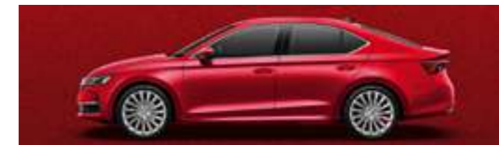
Velvet red metallic (*)