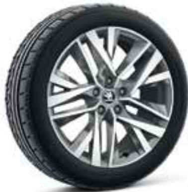
18" Lerna anthracite metallic alloy wheels, brushed