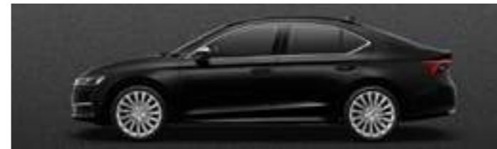
Magic black metallic