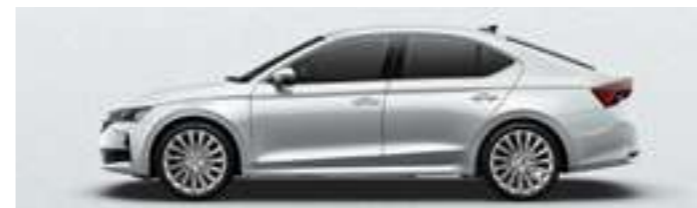
Moon white metallic (*)