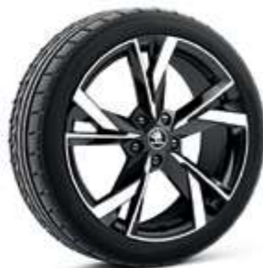
19" Draconis black metallic alloy wheels, brushed