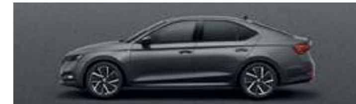
Graphite grey metallic