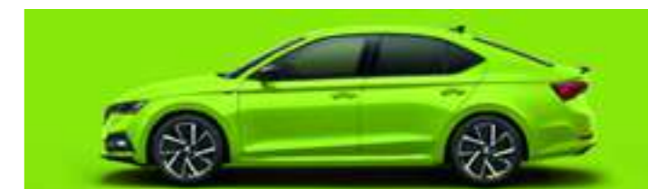
Mamba Green uni (*)