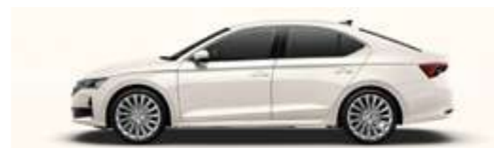
Candy white uni (**)