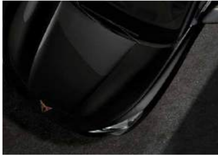
← MIDNIGHT BLACK 3 T