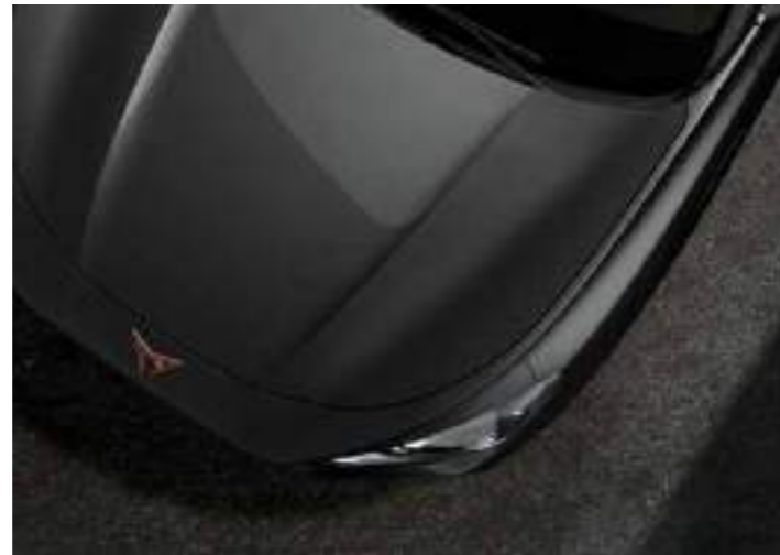
→ NEW TIMANFAYA GREY 2 T