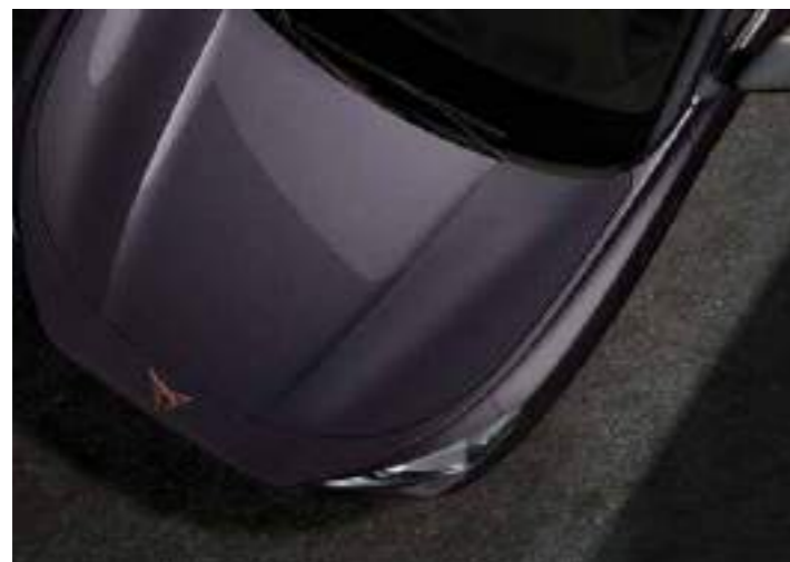
← NEW DARK VOID 3 ■