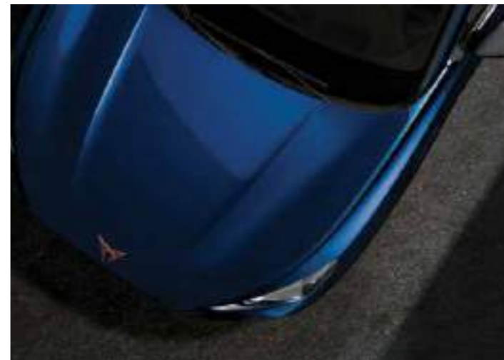
← NEW COSMOS BLUE 2 ■