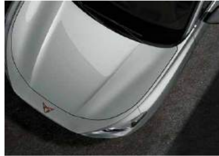
← GLACIAL WHITE 2 T