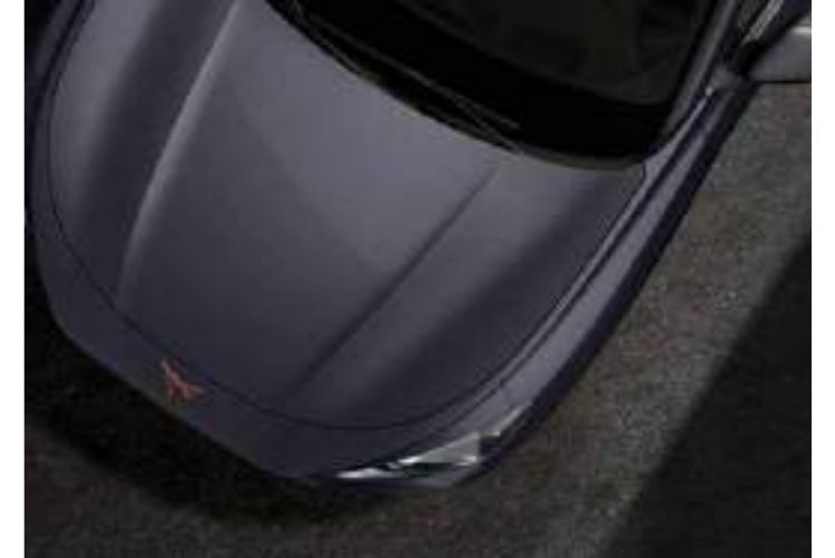
→ GRAPHENE GREY 3 ■