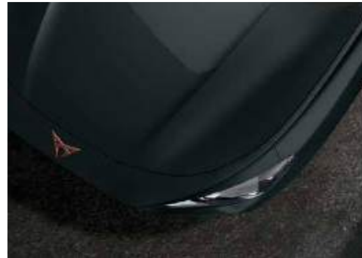
← FIORD BLUE 1 T